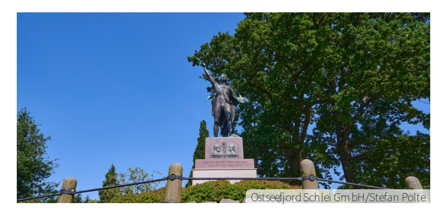
Bound: Historischer Stadtrundgang in Schleswig: Friedrichsberg und das Bellmannviertel